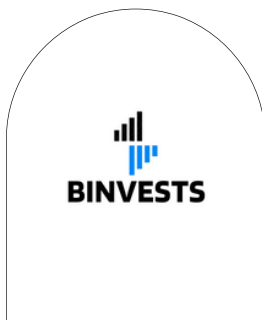
BINVESTS Founder - Deepak