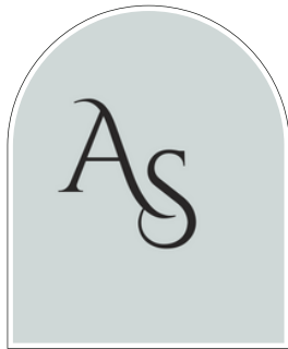
Around Services Founder - Shivani