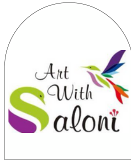
AWS Gallery Founder - Saloni