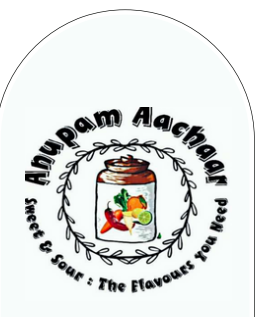
Anupam Pickles Founder - Ankush