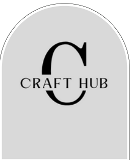
Craft Hub Founder - Dimpil