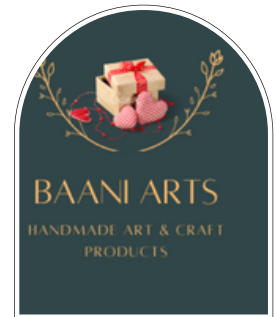
Baani Arts Founder - Sheetal