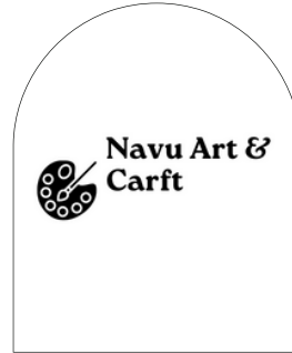
Navu Art & Craft Founder-Navneet