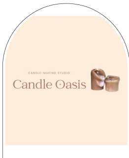
Candle Oasis Founder - Prachita