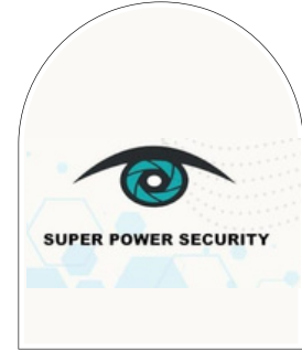
Super power Securities Founder-Sumit