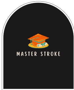
Master Stroke Founder - Apurva