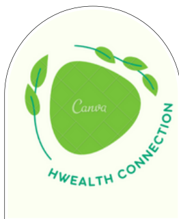
Hwealth Connection Founder - Namandeep