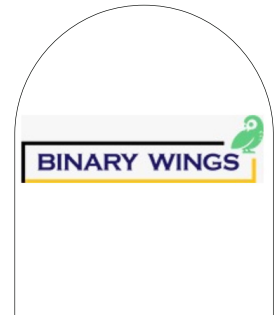
Binary Wings Founder - Manoj