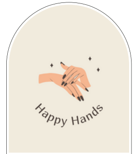
Happy Hands Founder-Dimpal