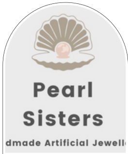
Pearl Sisters Founder - Anu