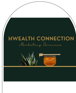
Hwealth Connection Founder - Naman