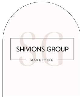
Shivions group Founder - Smile